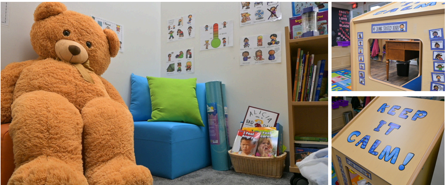
Alicia emphasizes that while the room is a valuable new space, the real success lies in equipping students with the internal tools to self-regulate and rejoin their peers.

Many programs might feel they don't have the space or budget for a separate room (and in-class tools should be the top priority). The goal isn't a fancy room; it's to build emotional intelligence for later life. When asked for recommendations of just one or two must-have sensory items, Alicia mentions fidget toys, then comes back to the life-size teddy bear. “A big, soft something to hug,” she says. “It makes them feel secure without needing a specific person.” Ultimately, the program’s new space is a means to an end: equipping children with the internal tools they need to return to the vibrant rhythm of the classroom. As Alicia summarizes, “I’m glad we have the room, but I’m glad when it’s not being used!”