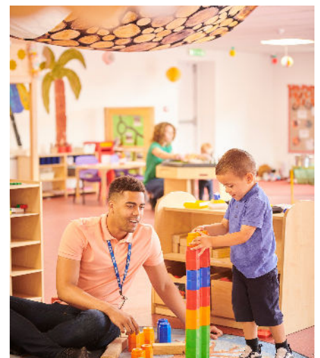
A thoughtfully-placed low shelf creates a protected area for building, but still allows for visibility.