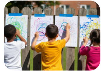
AI image generated with Google Gemini

Bubble art - Mix non-toxic bubble solution with some drops of food coloring, non-toxic paint, or liquid watercolors. Children can dip the bubble wand in the dyed solution and blow bubbles onto a piece of paper. (This activity may be best for children over 3 who can safely blow bubbles without ingesting them!)