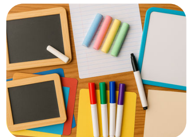
AI image generated with Microsoft Copilot

These are just a few ways to incorporate writing concepts into your day. We would love to hear about fun and engaging ways you are encouraging literacy in your program! Email your thoughts to ecinstitute@udel.edu .