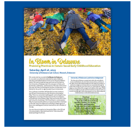
In Bloom Conference: Promising practices in nature-based early childhood education. There's still time to register!