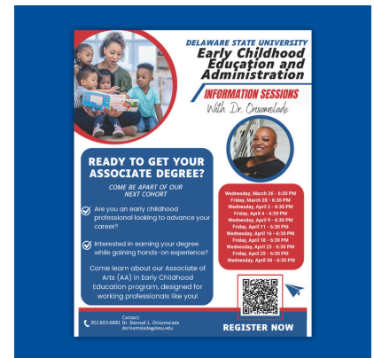
Join one of their information sessions to learn how you can get started!

Delaware State University (DSU) is hosting a series of information sessions about its Associate of Arts (AA) in Early Childhood Education program. The program is designed for working professionals, allowing you to gain hands-on experience while advancing your career. See the attached flyer for info session dates and registration!