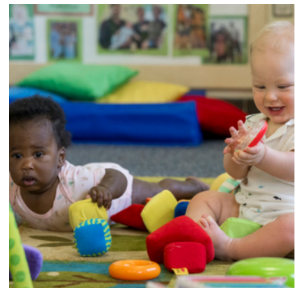
Image: Infants play with blocks, balls and other colorful toys in UD's Early Learning Center.

DIEEC is proudly partnering with the ELC on the CCAMPIS grant (Child Care Access Means Parents In School) that provides child care funding support for UD students. Read more about the "living-learning laboratory" at the ELC.