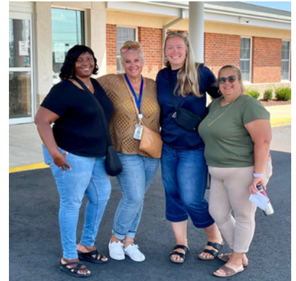
Image: Members of the home-based team planning committee visit the Cheer Center in Georgetown as they prepare for the upcoming conference on November 16.

The third annual 1st State Family Child Care Conference will take place on Saturday, November 16 at the Cheer Center in Georgetown. This year's theme is "Your Best Self, For Their Best Future," and we can't wait to connect and share with Delaware's family child care community! To learn more or register, please visit our conference web page . Registration closes on October 15th.